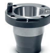
Steep taper SK 25 to SK 60