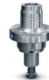
Hydraulic cylinder shaft D 1.25" (32 mm)