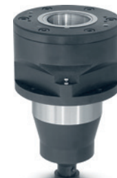
Polygonal shank taper PSC 32 to PSC 100