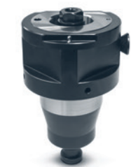
Hollow shank taper HSK 25 to HSK 125