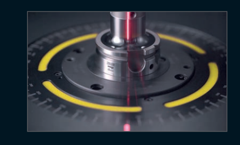
With optimally and highly precisely balanced grinding wheels, you can achieve longer spindle running times.