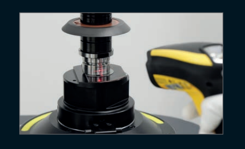
The identification of the measured tools and grinding wheels with »zidCode« starts the automatic data transfer to the grinding machine.