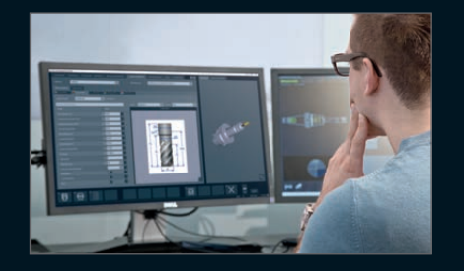
Generation of the measuring sequence at the external workstation using the software module »caz« which simulates a measuring machine.

Scan the QR code and find out more about the smart set-up process from ZOLLER.