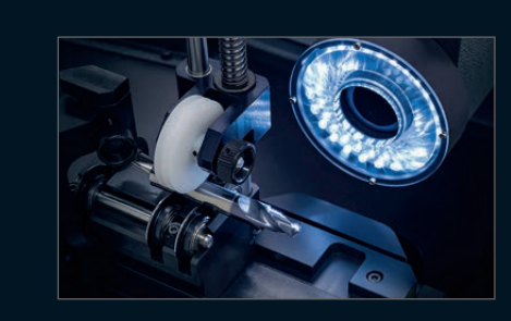
The inspection machine »pomBasic« checks tools on up to 70 tool parameters in a matter of seconds. Insert, align, measure.