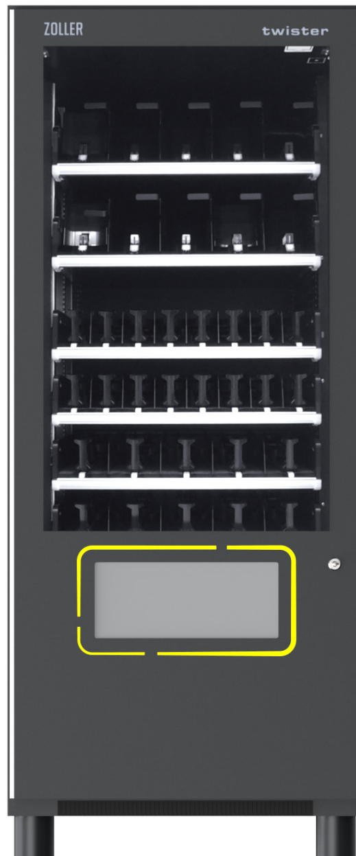
ZOLLER »twister« automatic dispenser in version 1: 2 levels with 5 high rows at the top and 4 levels with 8 low rows at the bottom

In combination with the »quickPick« control software, »twister« automatic dispensers ensure transparent issue and easy inventory checks for your tool components and accessory parts.