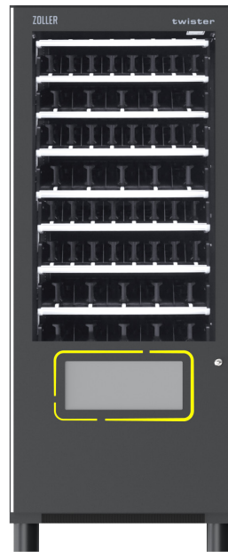
»twister« version 2: 4 levels with 8 low rows each at the top and 4 levels with 10 low rows at the bottom

The levels in the »twister« can be divided into product rows of different widths by inserting and removing the partitions on the shelves. The output motors in each row can be individually removed if needed.