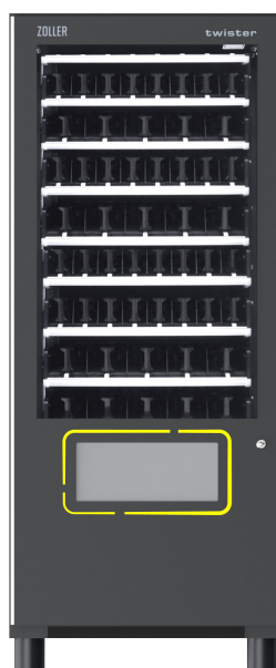
»twister« version 2: 4 levels with 8 low rows each at the top and 4 levels with 10 low rows at the bottom (shown in the image with individually adjusted compartment widths)

The levels in the »twister« can be divided into product rows of different widths by inserting and removing the partitions on the shelves. The output motors in each row can be individually removed if needed.