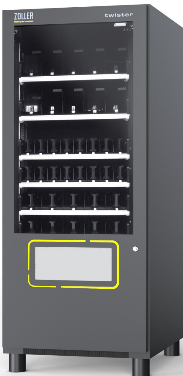
ZOLLER »twister« automatic dispenser in version 1: 2 levels with 5 high rows at the top and 4 levels with 8 low rows at the bottom

In combination with the »quickPick« control software, »twister« automatic dispensers ensure transparent issue and easy inventory checks for your tool components and accessory parts.